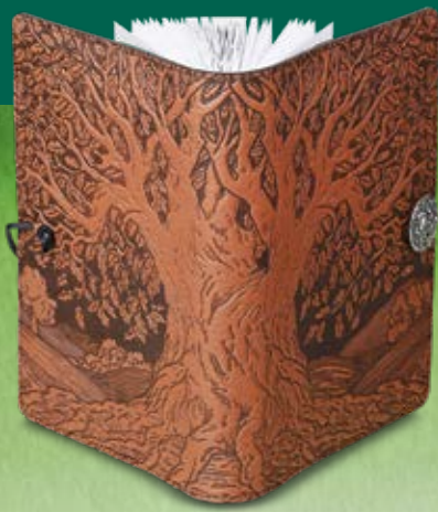
Druid's Oak C14060 Large Journal $95 C14840 Small Journal $75 C14930 Checkbook Cover $50