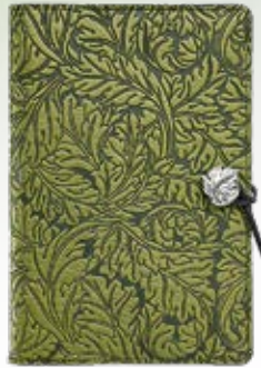
Leaves C14077 Large Journal $95 C14878 Small Journal $75 C14079 Checkbook Cover $50