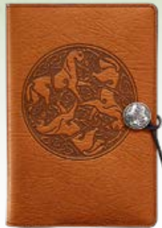
Celtic Horse C14087 Large Journal $95 C14888 Small Journal $75 C14089 Checkbook Cover $50

The spirit of nature inspires these embossed leather accessories. Choose from the majestic Druid's Oak, wrapping around the entire cover; the Celtic Horse Triskelion, moving ever forward; classical Acanthus Leaf, a symbol of enduring life; elaborate knotwork Celtic Hounds, recalling intricate manuscript illumination; or the Tree of Life, framed with knotwork birds. Exceptional-quality journals in two sizes are refillable with standard blank-book inserts. Large journals are 6" x 9", small are 4¾" x 7". Made in USA.