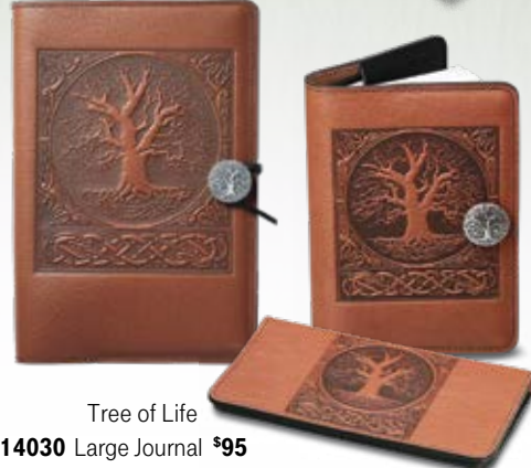
Tree of Life C14030 Large Journal $95 C14830 Small Journal $75 C14050 Checkbook Cover $50