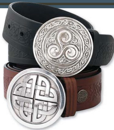
Top: Triskelion Bottom: Eternal Knot