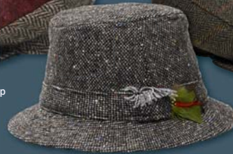
Donegal Tweed Walking Hat (B1003)