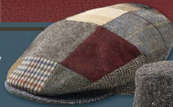
Patchwork Vintage Cap (B1001)

B1023 Inside-Out Patchwork Hat, Multi-Color $78 See It Online