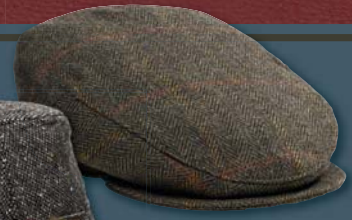
Herringbone Vintage Cap (B1020)