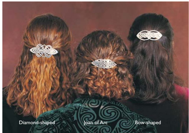
Diamond-shaped Joan of Arc Bow-shaped