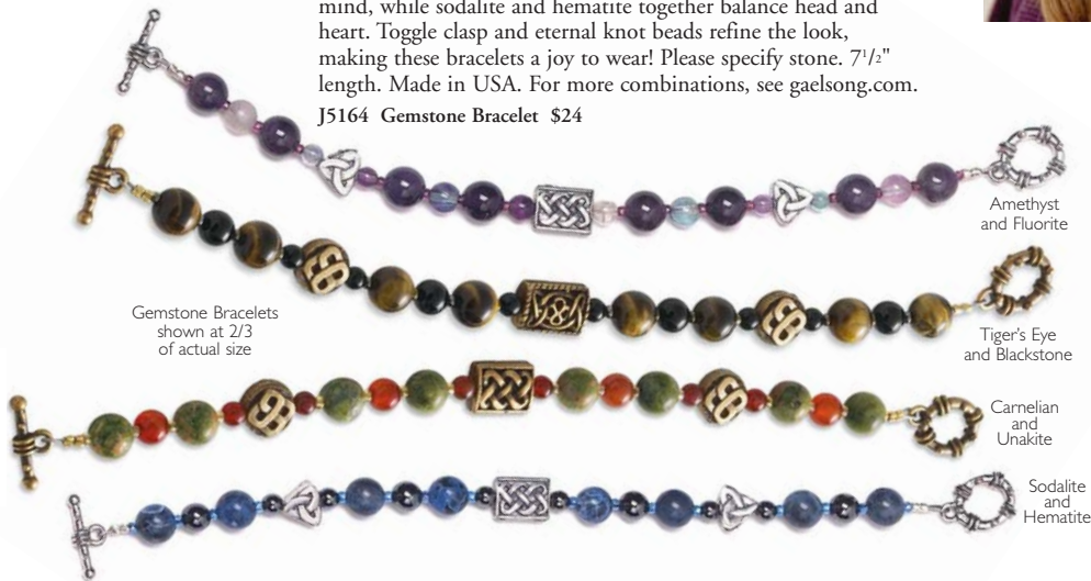
Gemstone Bracelets shown at 2/3 of actual size

Gemstones are a gift from the heart of the Earth. Amethyst and fluorite are associated with spiritual transformation and intuition; tiger's eye and blackstone bring self-confidence and courage; carnelian and unakite ground energy and clear the mind, while sodalite and hematite together balance head and heart. Toggle clasp and eternal knot beads refine the look, making these bracelets a joy to wear! Please specify stone. 7 1/2" length. Made in USA. For more combinations, see galsong.com. J5164 Gemstone Bracelet $24